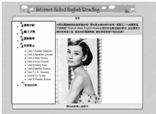
Figure 1. The WBEOR learning system homepage

Figure 2). We also offered some related links connected to other web pages. The system contained access to a public discussion area and an announcement board, making multiple communication avenues available for students and teachers. We used the course management system to process students' registration, access logs, assignment delivery, and feedback.