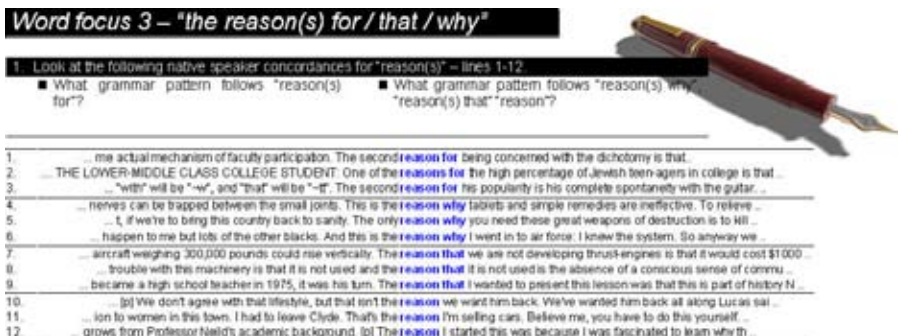
Figure 4.1: Identifying basic native speaker patterns

The materials, thus, follow a path which encourages learners to notice any gap between their own writing and a model, expand on that model and reflect on their own writing.